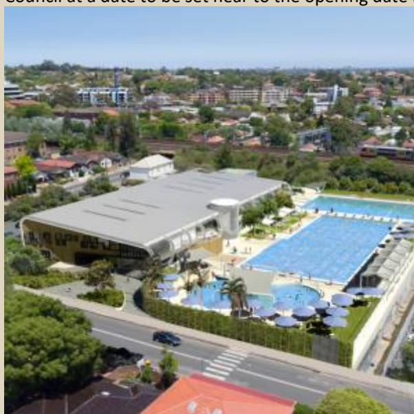
Image of proposed new Aquatic Centre from Inner West Council's website