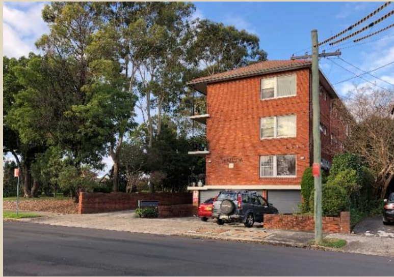
60 Victoria Street Ashfield

While preparing for a guided walk along Ashfield's Victoria Street, I was struck by the block of flats at 60 Victoria Street beside leafy Allman Park. Architecturally it's an ordinary 1960's block, but who built it and who lived there beforehand?