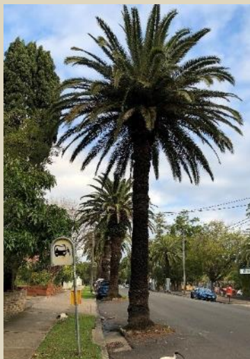
Victoria Street Ashfield

The house, "Handsworth" built in around 1907, was owned by members of the same family for approximately 50 years. They must have loved it there.