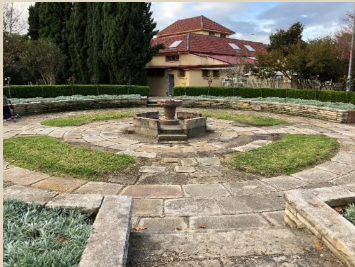
Allman Park Ashfield

Website: https://ashfieldhistory.org.au/