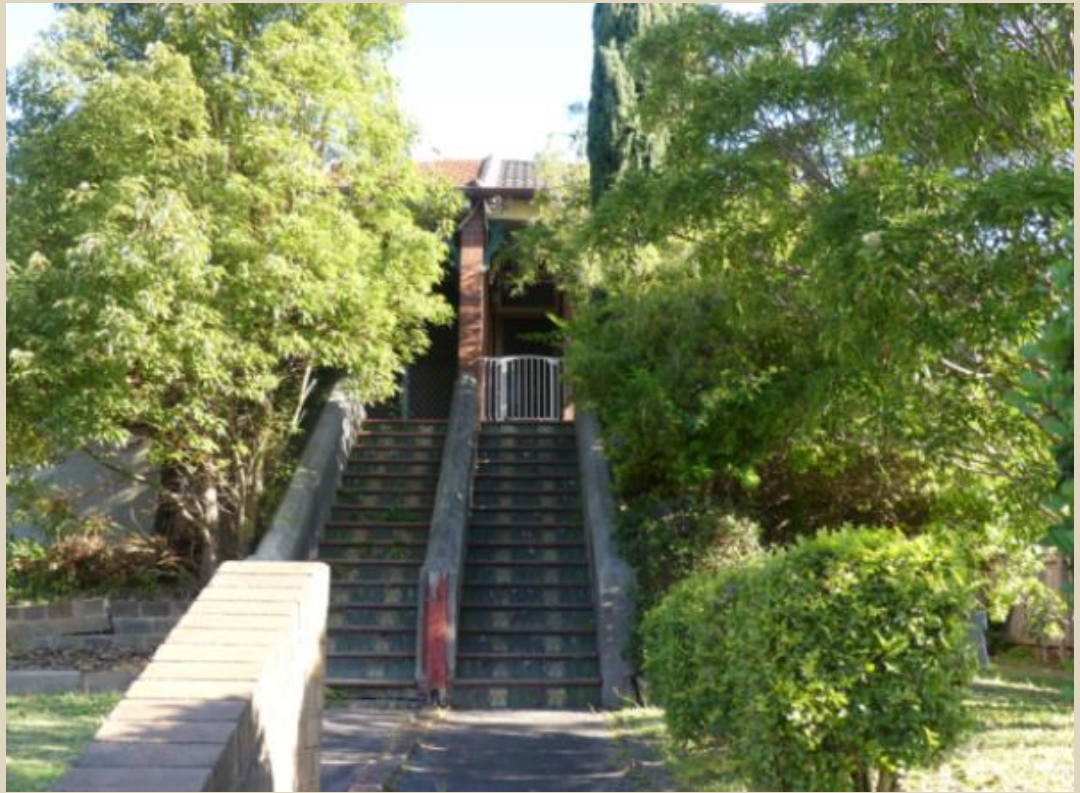
Parramatta Road houses alert

The Society has been alerted that four properties on Parramatta Road, to the east of the Sloane Street intersection, Nos 30 -36 Parramatta Road are for sale as a development site. Concern was raised regarding their potential heritage value and the possibility that they may be demolished. Committee Member Colin Webb has photographed the houses.